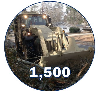
MILES OF ROADS CLEARED