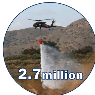
GALLONS OF RETARDANT DROPPED