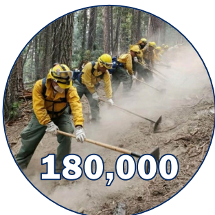
PERSON-DAYS OF SUPPORT