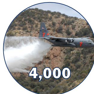
AERIAL DROP MISSIONS